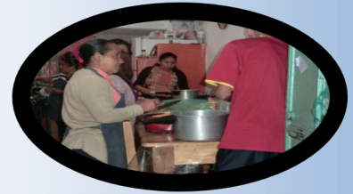
Preparing picnic lunch