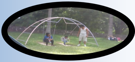
At the swings