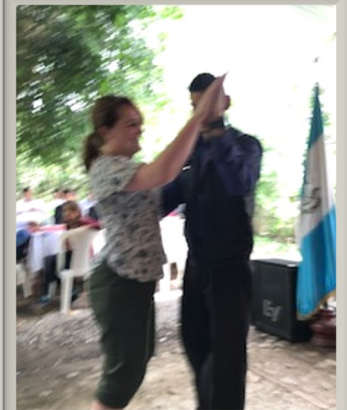
Our Leader dances with student at SEL school in Antigua.

Remember: We are all in mission by virtue of our Baptism