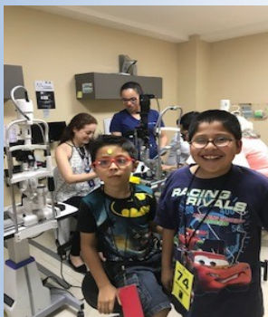
Sometimes we take kids for glasses

You can send a tax free donation to the address below