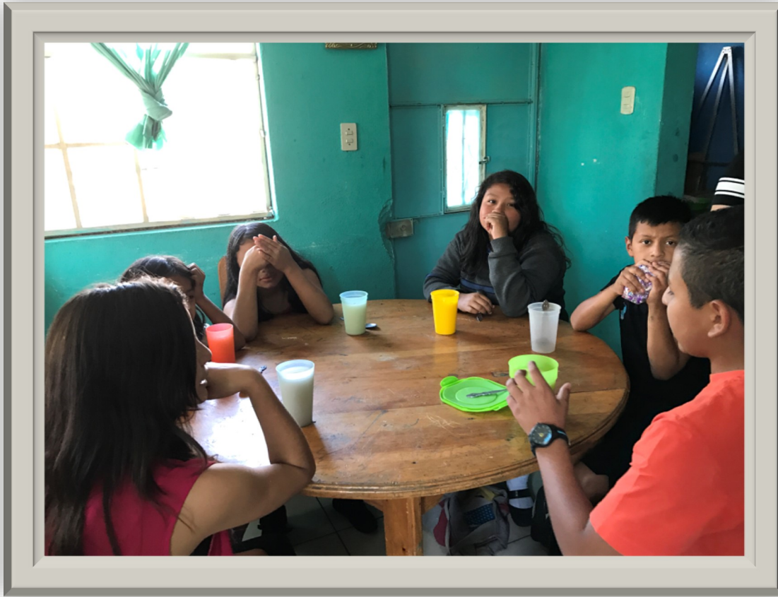
Refreshments in the library room at Caminando Por La Paz

There are many ways to become a part of our efforts.