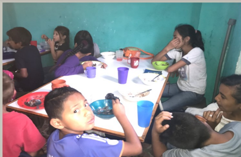
Pre Covid the kids are fed before tutoring

You can send a tax deductible donation to: