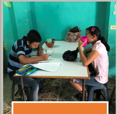
Our kids at tutoring

The importance of our coffee sales can not be over stated. As most of our supporters know the purpose of the coffee project is to provide on-going funding for Caminando Por La Paz in Guatemala City. We are far from our goal of having coffee sales as the sustaining financial support of our efforts. However we remain hopeful that in time that dream will become a reality.