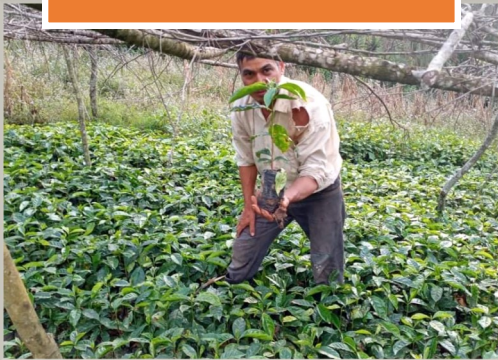
The beginning of a cup of coffee

Fortunately our coffee project is continuing to move in a successful direction. We are about to try a few things to speed up the process of improving our market share.