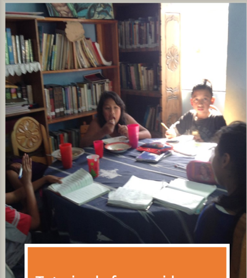
Tutoring before covid-19 It will be again