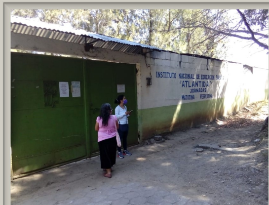
Entrance to just one of the schools for our kids

During the pandemic our kids are utilizing technology and have their classes on the internet.