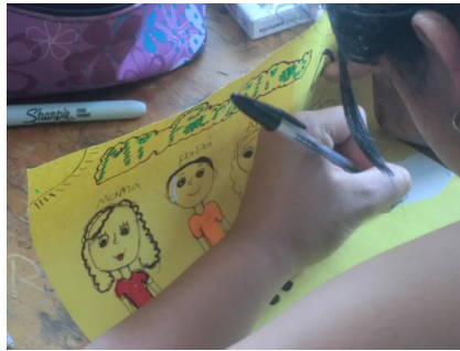
STUDENT ART PROJECT—FAMILY