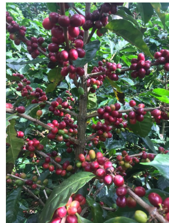
Coffee cherries (berries) ready for the harvest.

You can purchase our premium Honduras Coffee on our website .