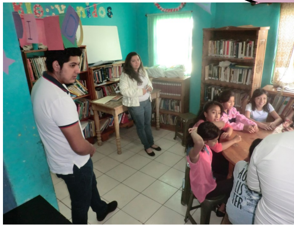
Students in our library class room. Prior to the Pandemic

Your purchase of our Family Coffee supports our efforts in Guatemala City