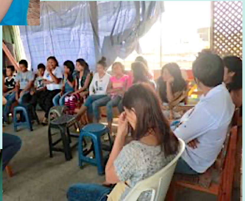
We gathered for a short ceremony after the shoe distribution.