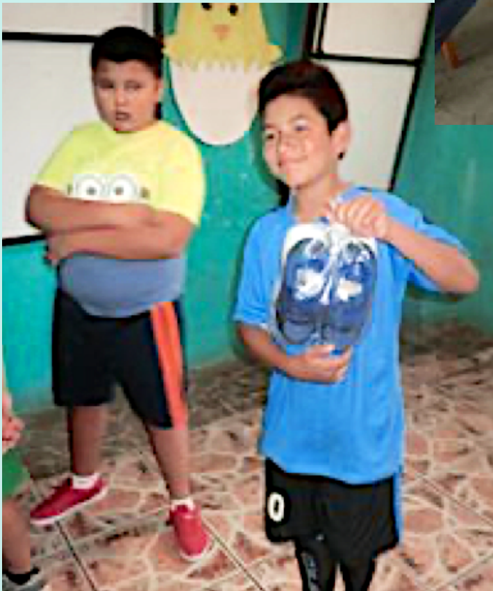
Thank you, Shoes to the World! Your effort to help those we serve is greatly appreciated.