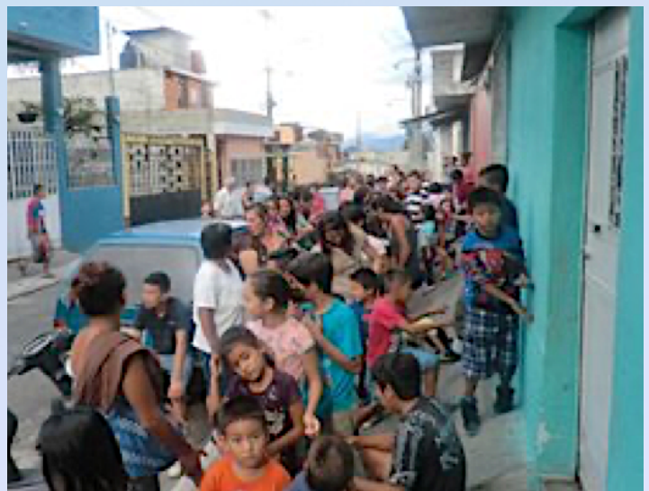
2016 Shoes to the World distribution

We put a lot of effort into carrying out the shoe distribution. Before the distribution, we will need to identify those who will receive shoes and obtain the correct size for each recipient. And when we arrange the process for handing out the shoes, we make it an upbeat, exciting event. All in all, it is a lot of work for our staff and volunteers but we all feel it is well worth our effort.