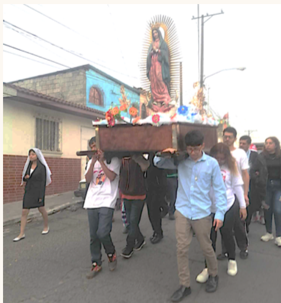
Feast of Our Lady of Guadalupe December 12