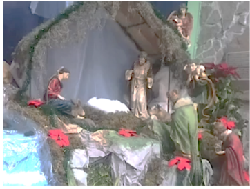
The creche, the tree,