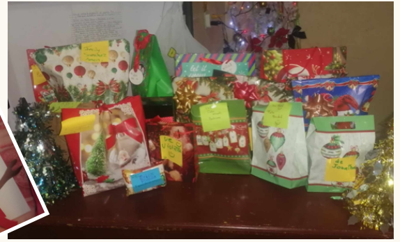
The cards, gifts, and posadas