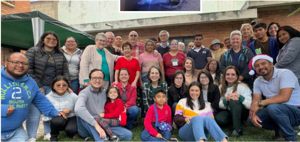
Celebrating with our Maryknoll Affiliate community.