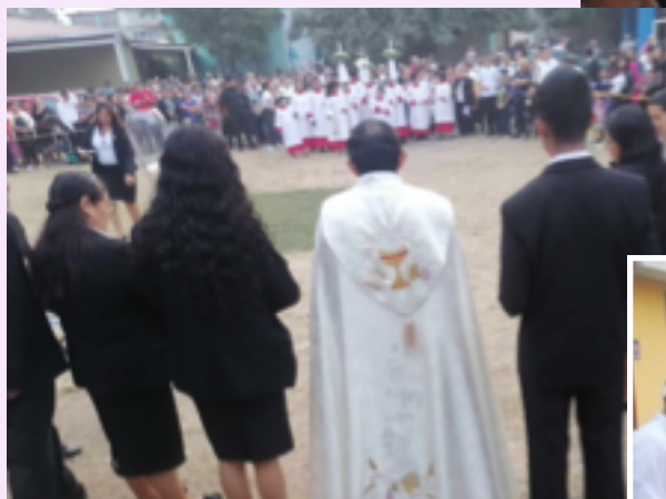
Holy Saturday bonfire