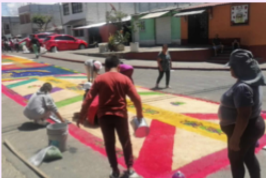
The streets are alive with colorful designs.