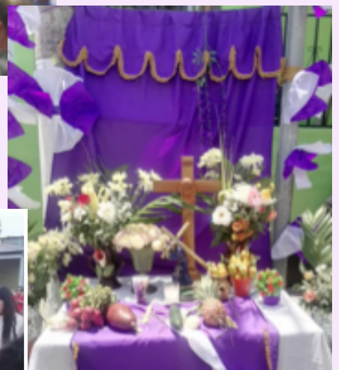
Easter Sunday offerings