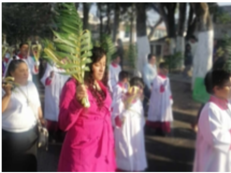
Palm Sunday – A neighborhood procession